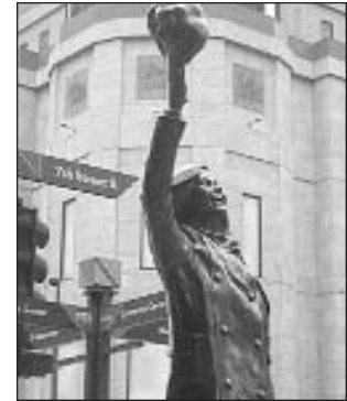
Mary Tyler Moore Statue, Downtown Minneapolis